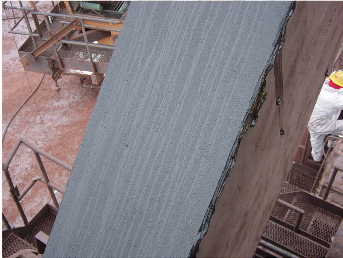
Top of stick in Snow and Rain