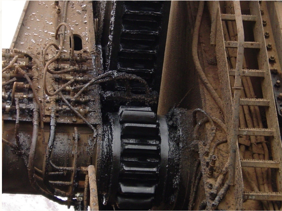
Crowd Rack and Pinion at -30 Below F