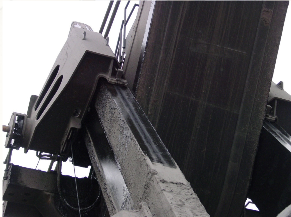
Dipper Handle at -30 Below F